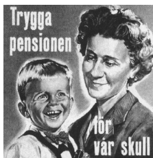
Old pension poster

S Försäkringskassan har överlämnat sin beräkning av inkomstindex för år 2006 till regeringen. Av den framgår att de inkomstgrundade pensionerna kommer att öka med 1.1 procent vid årsskiftet. Med de gamla ATP-reglerna hade ökningen varit 0,8 procent. Det nya systemets indexering av pensionerna användes första gången år 2004. Indexeringen har hittills gett pensionärerna högre pensioner jämfört med vad de skulle ha fått om det gamla systemet varit kvar. Under ATP-systemets 40-åriga existens ökade inte pensionerna reallt i värde ett enda år.