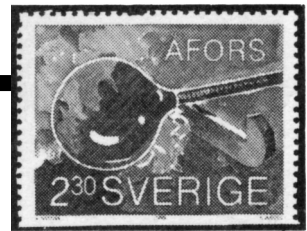
(Above) A stamp celebrating the Åfors glass works.